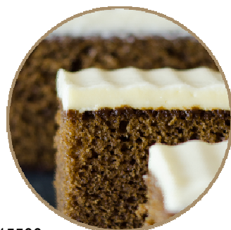
15586 • Ginger Kiss