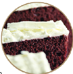
15592 • Red Velvet